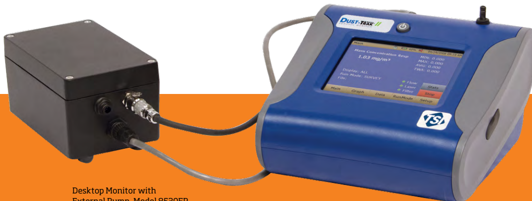
Desktop Monitor with External Pump, Model 8530EP