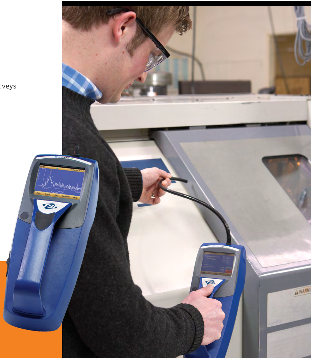
Handheld Monitor, Model 8532

TrakPro™ Data Analysis Software allows you to set up and program directly from a PC. It even features the ability for remote programming and data acquisition from your PC via wireless (922 MHz or 2.4 GHz) communications or over an Ethernet network. As always, you can print graphs, raw data tables, and statistical and comprehensive reports for record keeping purposes.